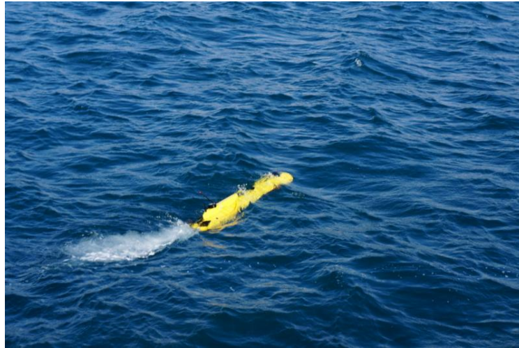
ECA Group: AUV A9 survey

The use of an AUV A9-M allows flexibly identical tasks at regular intervals, while maintaining normal operations in port. His altitude tracking very close to the bottom is a great advantage compared to surface vehicle or towed sonar.